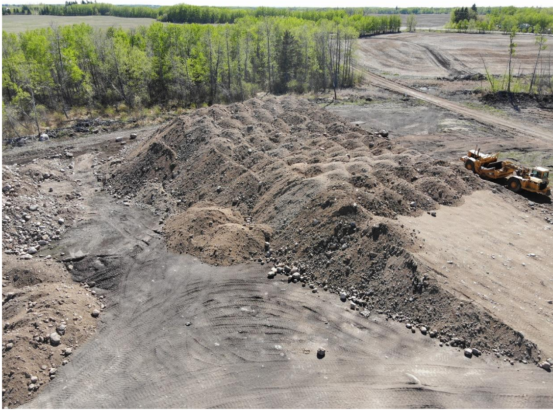
Page 15 of 15